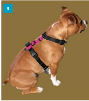
5 Given the wide variety of shapes of dogs’ bodies, ideally a harness should be adjustable along both sides of the neck and the body as well as along the back and along the sternum.