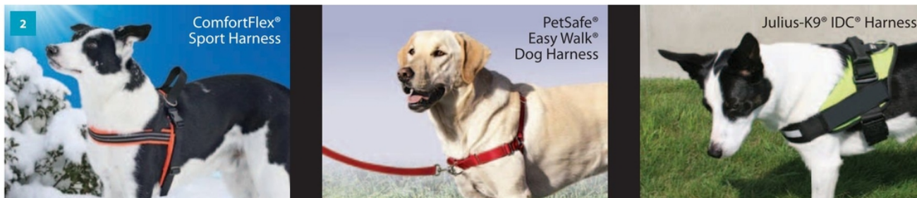
These are examples of restrictive harnesses, which cross the body over or below the shoulder joint.