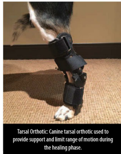
Tarsal Orthotic: Canine tarsal orthotic used to provide support and limit range of motion during the healing phase.

Slow return to normal companion activity is typically allowed eight weeks after surgery. This controlled return to companion activities should take approximately two to four weeks. Once the canine athlete is back to companion activities comfortably, then a sport-specific conditioning program should be initiated. The prognosis following surgery is excellent; however, attention needs to be paid to the opposite hind limb as the same condition can occur.